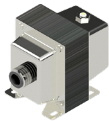
50 VA, 24 VAC Transformer